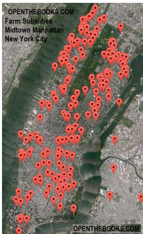
Table: New York City Farm Subsidies 2008-2011

Federal farm subsidy program dollars are flowing into the “urban areas”- where there are no farms. The recipients include one of the wealthiest families in our nation’s history; a conservation non-profit of international reputation; Wall Street financiers and Manhattan lawyers. Many entities receive the federal subsidies at their downtown office buildings, such as 30 Rockefeller Plaza, or at their million dollar residential condos.